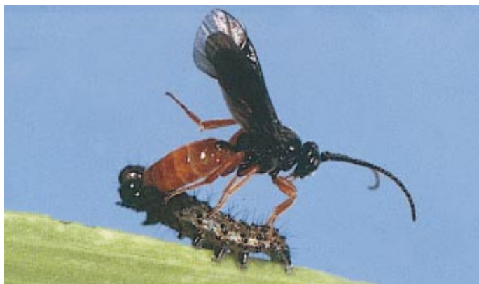
PAT GREANY USDA